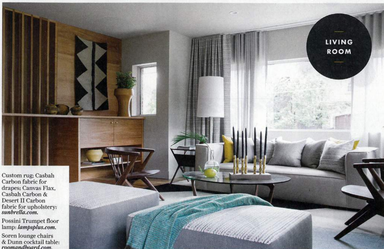
Custom rug; Casbah Carbon fabric for drapes; Canvas Flax, Casbah Carbon & Desert II Carbon fabric for upholstery: sunbrella.com . Possini Trumpet floor lamp: lampsplus.com . Soren lounge chairs & Dunn cocktail table: roomandboard.com .