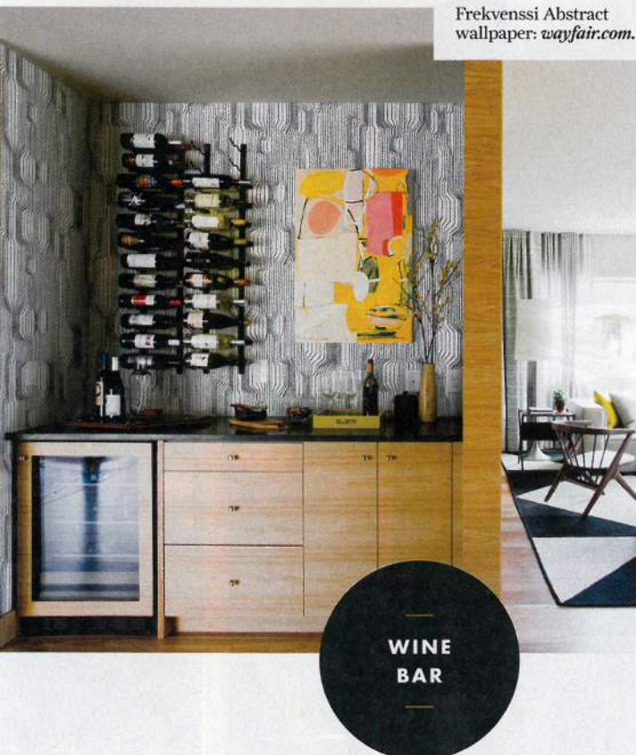
Frekvenssi Abstract wallpaper: wayfair.com .