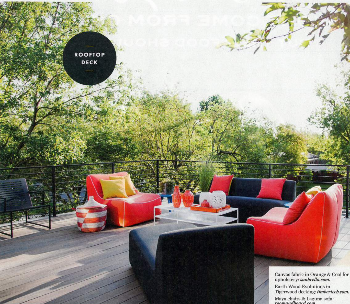
Canvas fabric in Orange & Coal for upholstery: sunbrella.com . Earth Wood Evolutions in Tigerwood decking: timbertech.com . Maya chairs & Laguna sofa: roomandboard.com .