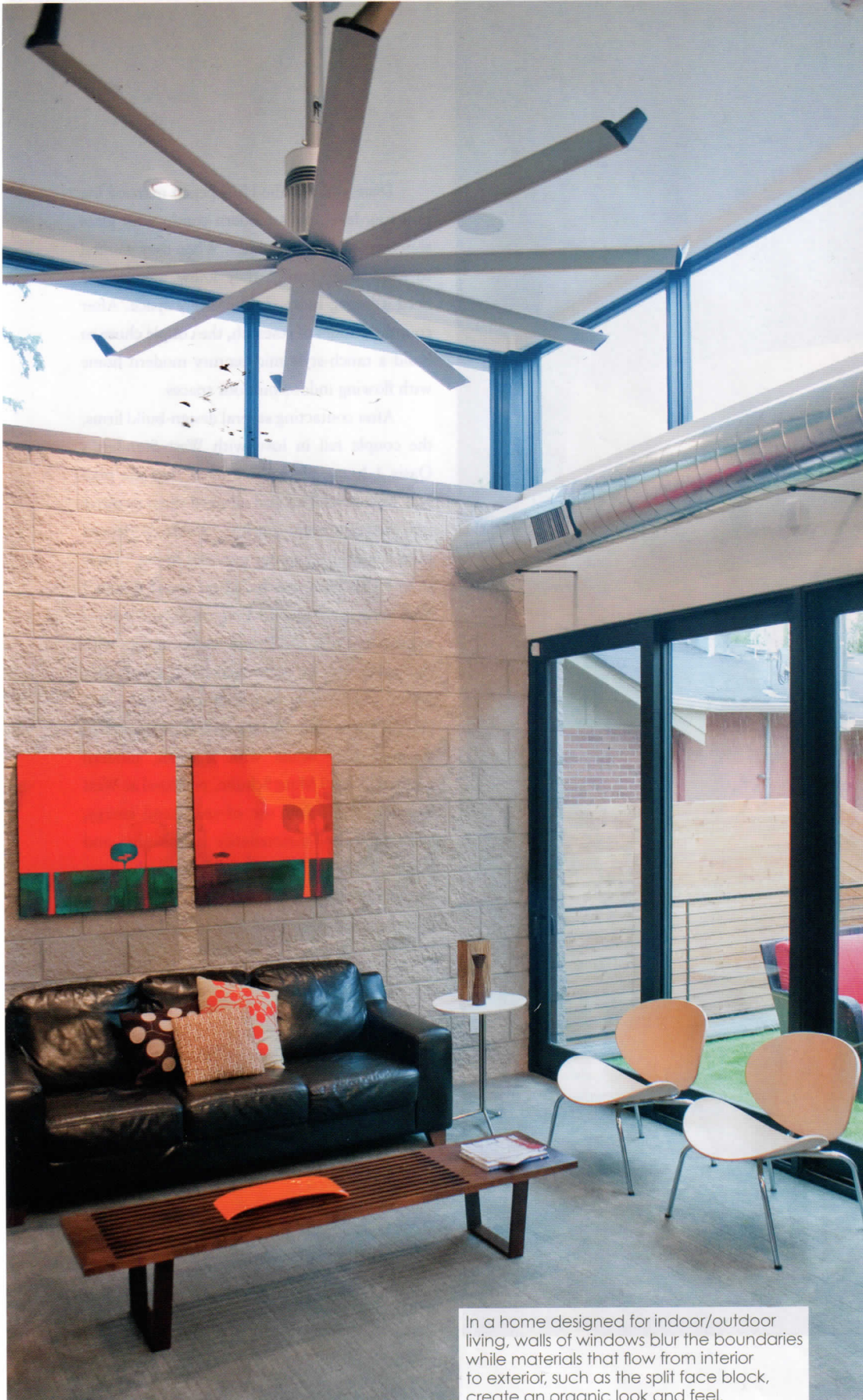
In a home designed for indoor/outdoor living, walls of windows blur the boundaries while materials that flow from interior to exterior, such as the split face block, create an organic look and feel.